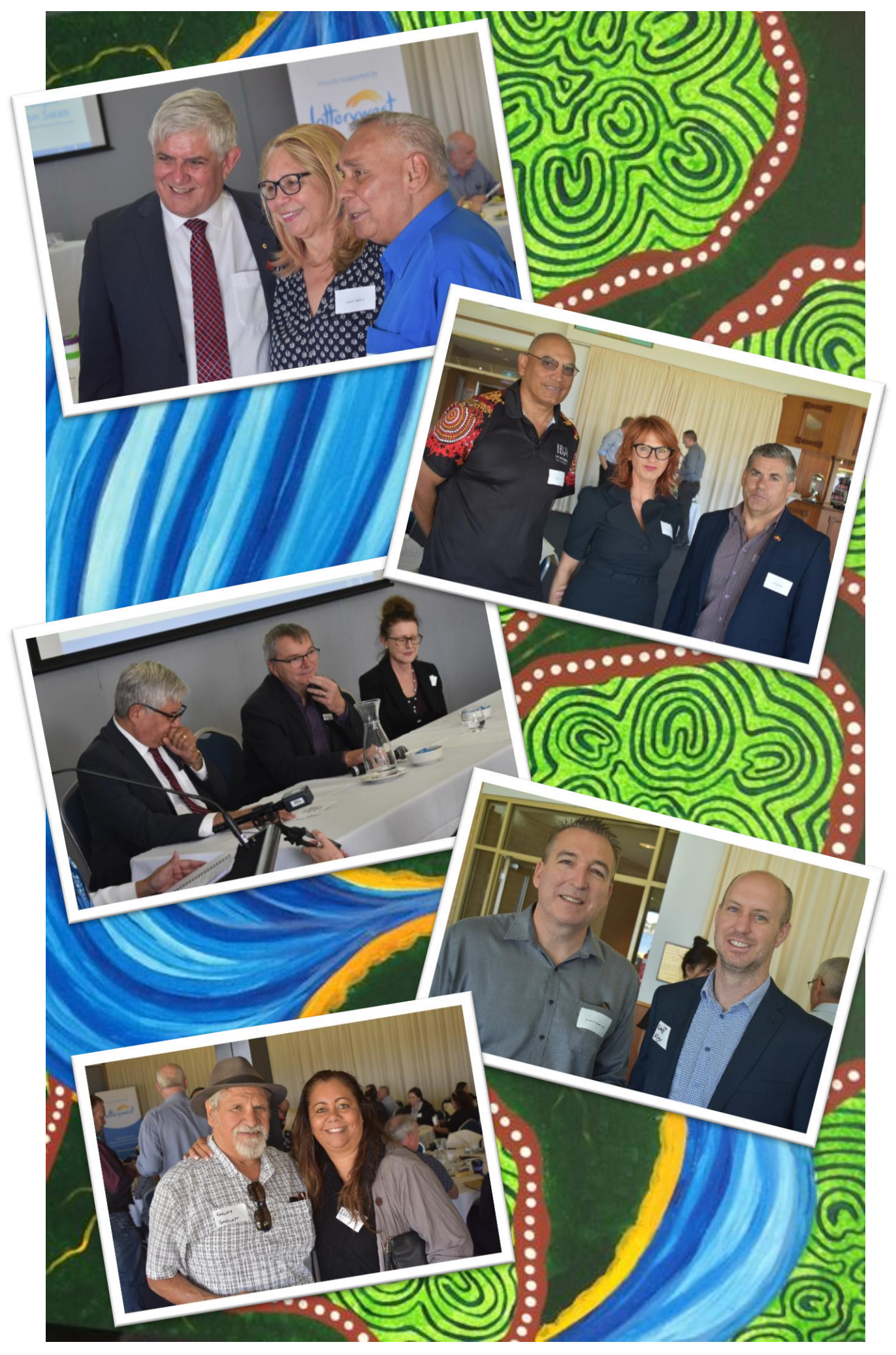
Metropolitan Aboriginal Housing Forum 2018